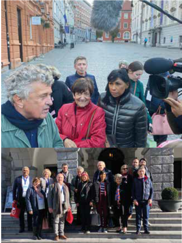
A study trip was conducted to Ljubljana to explore its city center, which is entirely pedestrianized, with the participation of numerous mayors and elected officials.